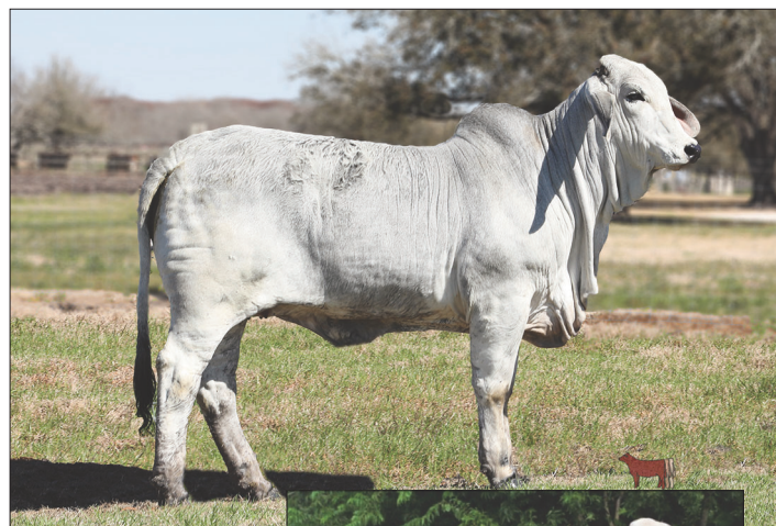
+JDH Mr Manso 840, sire

BW 4.4 WW 20.0 YW 34.0 MILK 5.0 REA 0.44 MARB -0.6