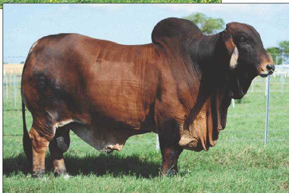
+SRS Mr. Captain Red Legs, sire