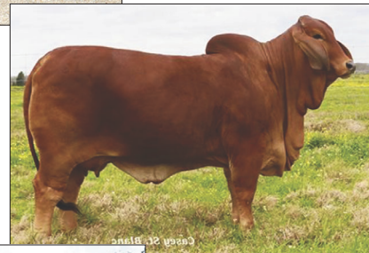
+CT Lady Pasco Rhineaux, dam