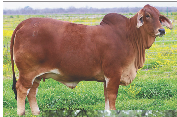
CT Lady Lacey Rhineaux, dam