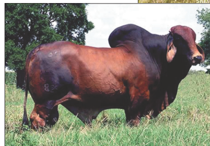
+Mr. 3H X-Ray 825, sire