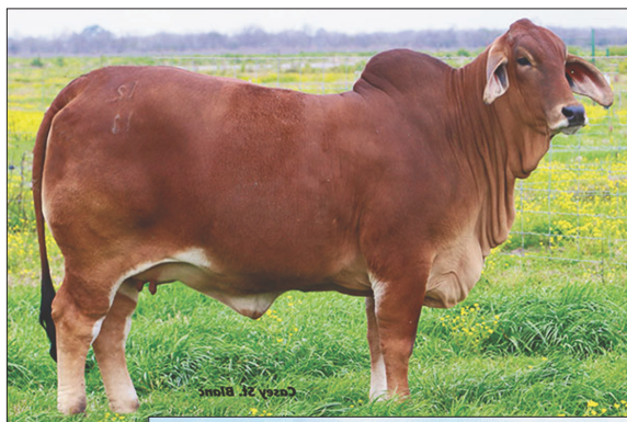
CT Lady Lacey Rhineaux, dam