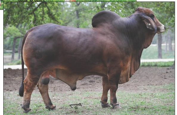
+Mr. Winchester Magnum 999/3, sire